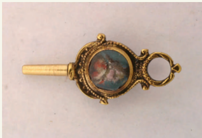
##3. A brass watch key from a collection France. It was fashioned from a broken fob seal of the same design as the Crown Point fragment. It is not known for certain whether it is French or English. This example has images of portraits behind the glass settings, unlike the Crown Point example.

The map of Crown Point drawn in 1774 shows two villages. One is shown as a compact "French Village" settlement extending along the lake shore southeast of the French fort adjacent to the "Batteau Wharf" in the bay, close to or at the location of the new road to the ferry landing that has been constructed because of the closing of the Crown Point Bridge. The other, larger village is shown west of the British fort, and perhaps it was formerly the "French village" site southwest of the French fort that included the "canteens" for refreshment and recreation of French soldiers. There are still many mysteries and unanswered questions about both village sites. A careful analysis and interpretation of the artifacts excavated in 2008 and 2009 remains to be done; all questions will never be answered, but the results of these excavations promise to provide new and useful information about this site.