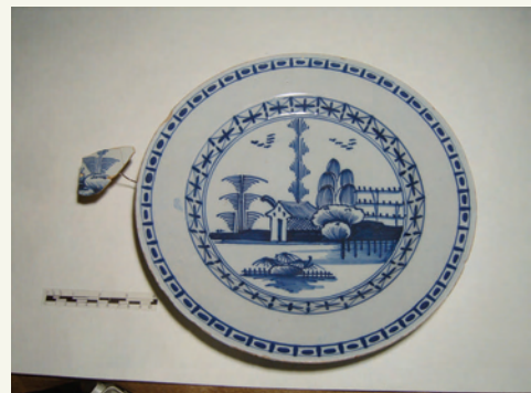
#5. Fragment of a delft bowl decorated with the same design as on an intact English delft plate, made probably in London. (The plate is in a private collection.)