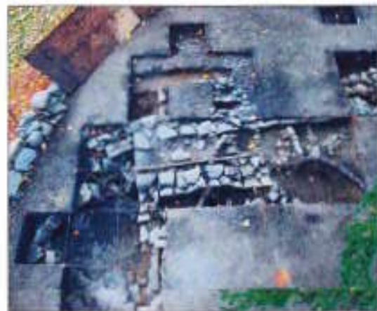
Above: The excavation to date.

There is no fee to participate in the excavation. However, we strongly encourage purchasing a Fenton History Center membership and/or making a cash donation to offset our equipment costs so we can continue the dig in the future.