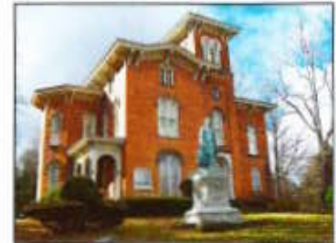
The Reuben E. Fenton Mansion ca. 1863